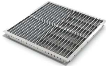
Directional Airflow Panels