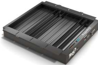
Airflow Dampers & Controls