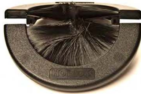
Round 4" Rack Mount Grommet - Part No. 40002