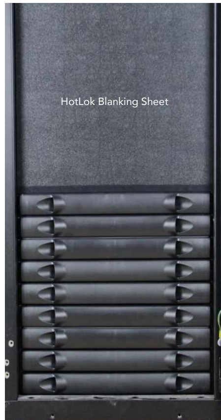
Additional 1U and 2U Blanking Panels for sealing racks up to 50U

Mounting Extrusion: Rigid PVC Blanking Sheet: ABS Fire Rating: UL 94 HB Fire Resistant Compliance: RoHS Compliant